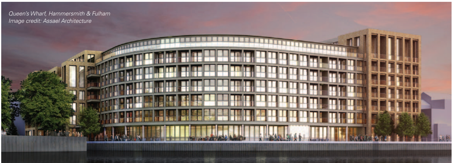
Queen's Wharf, Hammersmith & Fulham Image credit: Assael Architecture

Boatman's House 2 Selsdon Way London E14 9LA www.selftrade.co.uk/a2dfunding