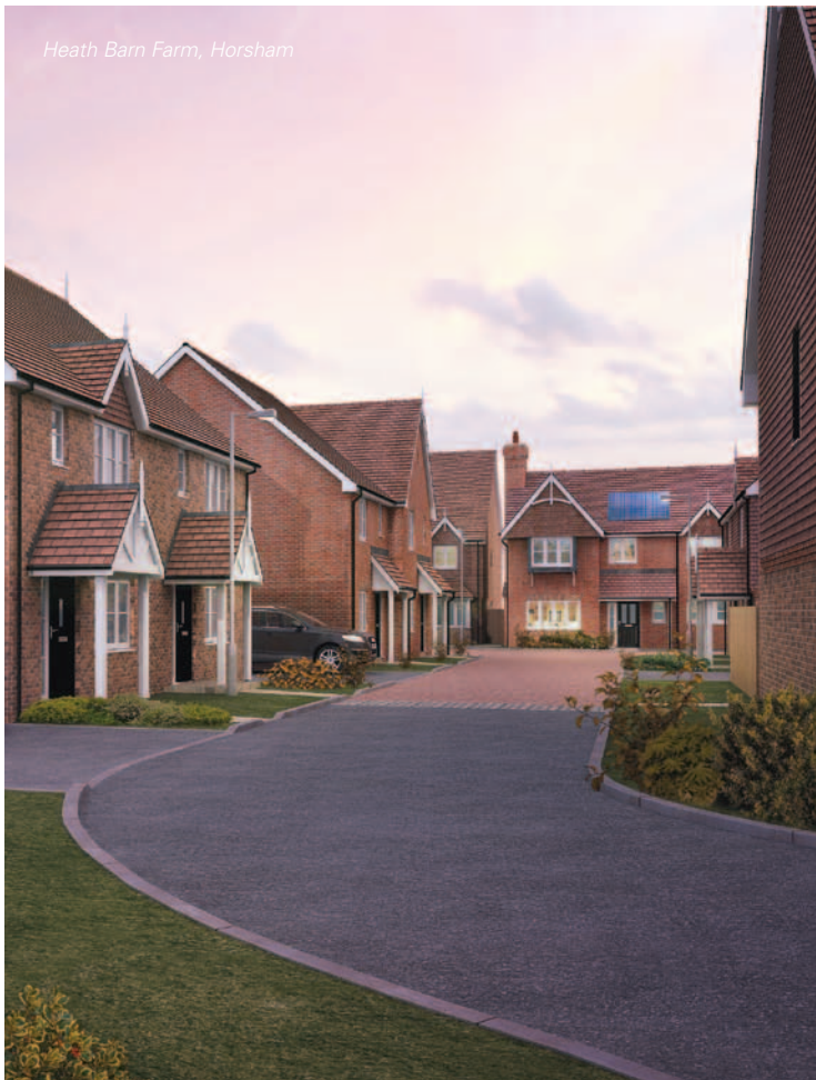
Heath Barn Farm, Horsham