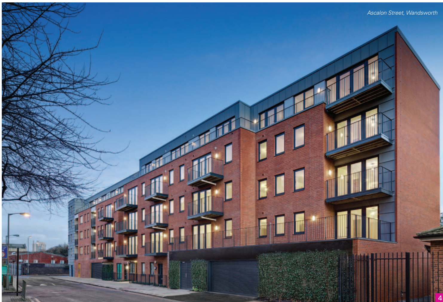
Ascalon Street, Wandsworth

The Guarantor is providing a financial covenant. Please see the “ Key Features of the Bonds ” and “ Key Risks of investing in the Bonds ” section of this document for more information.