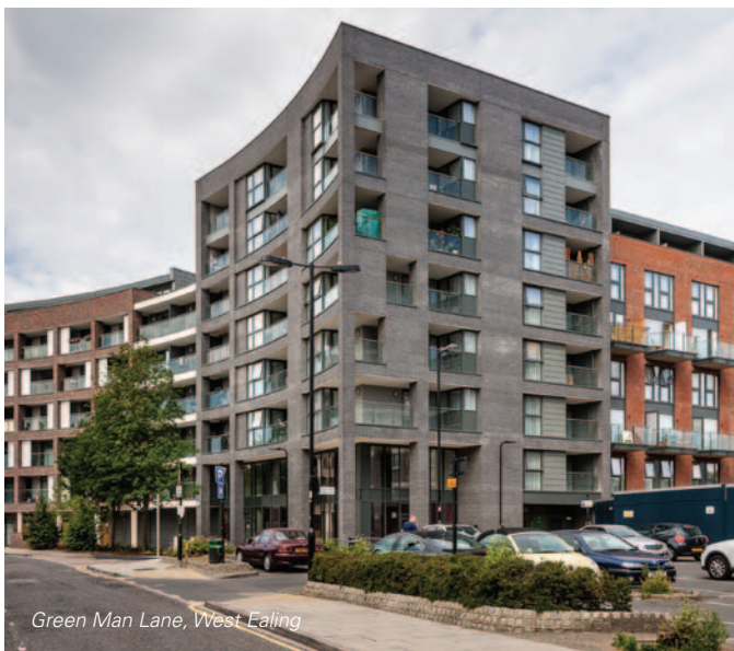
Green Man Lane, West Ealing