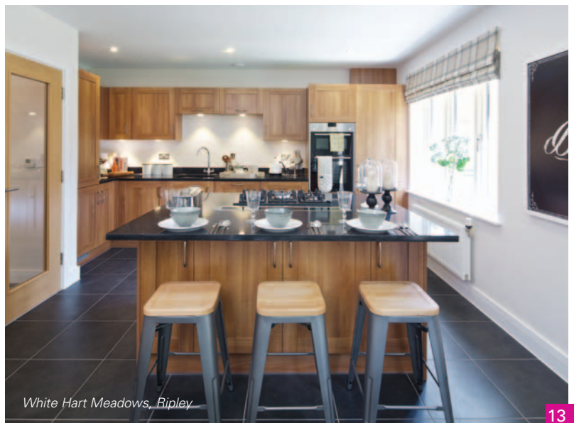
White Hart Meadows, Ripley